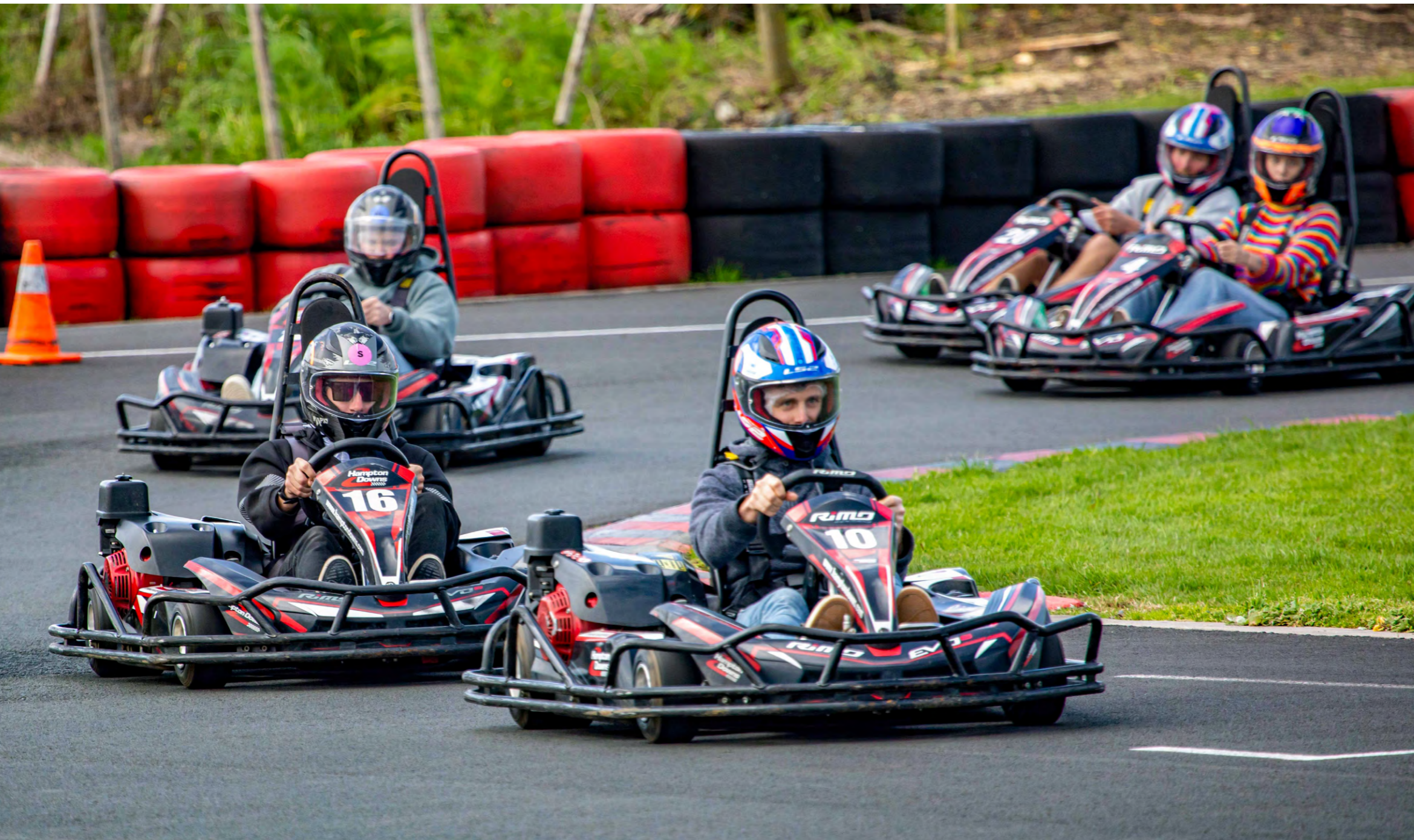
Photo left: Go Karting is one of the most popular activities at Hampton Downs.