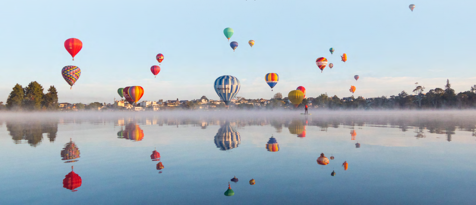
Photos: Left from top: The Italian Renaissance garden in the Hamilton Gardens, one of many enclosed gardens that tell the story of human history; Balloons over Waikato festival has been a yearly event since 1999. This page clockwise from top: Morrinsville showcases a collection of 60 life sized cow sculptures; the popular Hamilton city River Trails are a popular activity; Ngarunui Beach in Raglan is popular with surfers.

Now let's meet the people behind some of the more popular attractions in the Waikato.