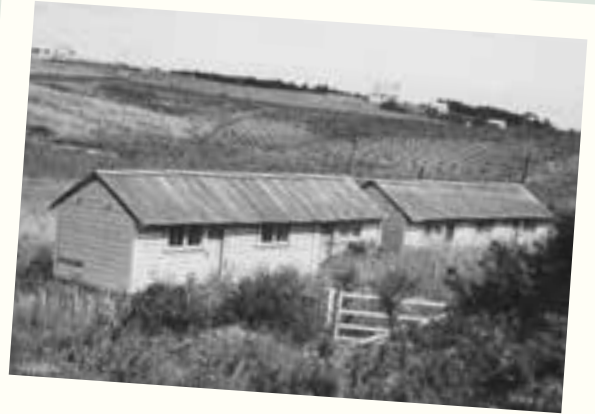
Walls and floors made of timber, with canvas roofs. How times have changed.

Here are some the Marram team found plus some you've sent us via an online competition: