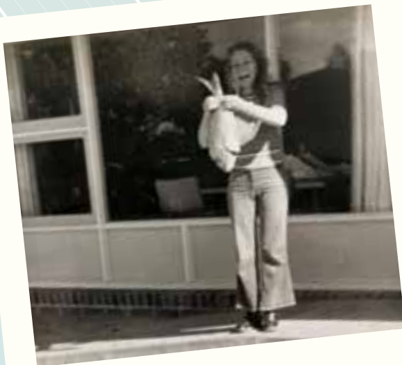
Honeymoon in 1972

In 1944, the Post Office Welfare Trust (as it was called back then) holiday makers packed their suitcases and headed to the first holiday homes situated at Musick Point, Auckland. You could say it was more of a camping holiday than a holiday house stay. With walls and floors made of timber and canvas roofs, holiday makers also shared the washing facilities during their stay. Wow, how times have changed!