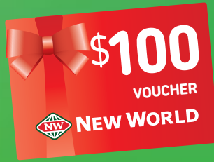
New World gift card

which you could be putting towards your grocery shop.