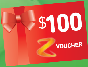
Z gift card

Have a look around your office. Who looks like they need a holiday? Probably everyone huh? Well here's your chance to do a good deed and in return we'll give you a voucher.