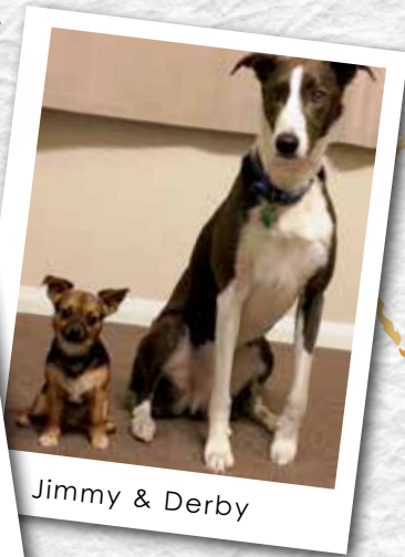
Jimmy & Derby