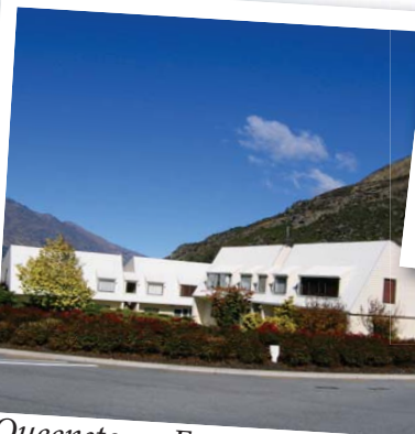
Queenstown East Work in progress...