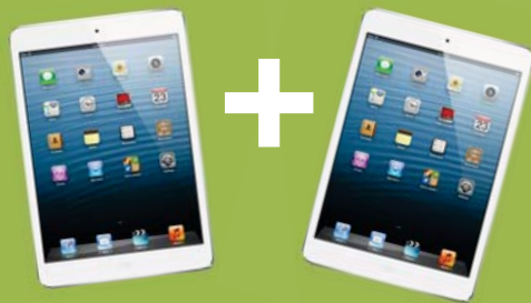
iPad mini – your chance to win!