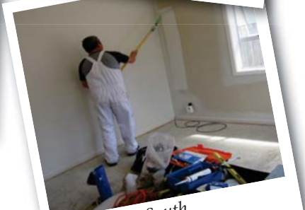
Wellington South Work in progress...