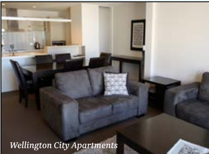
Wellington City Apartments