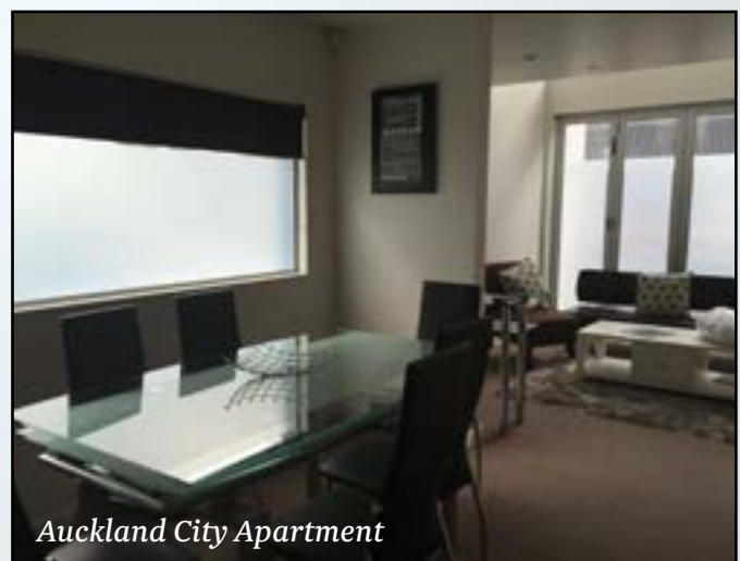
Auckland City Apartment