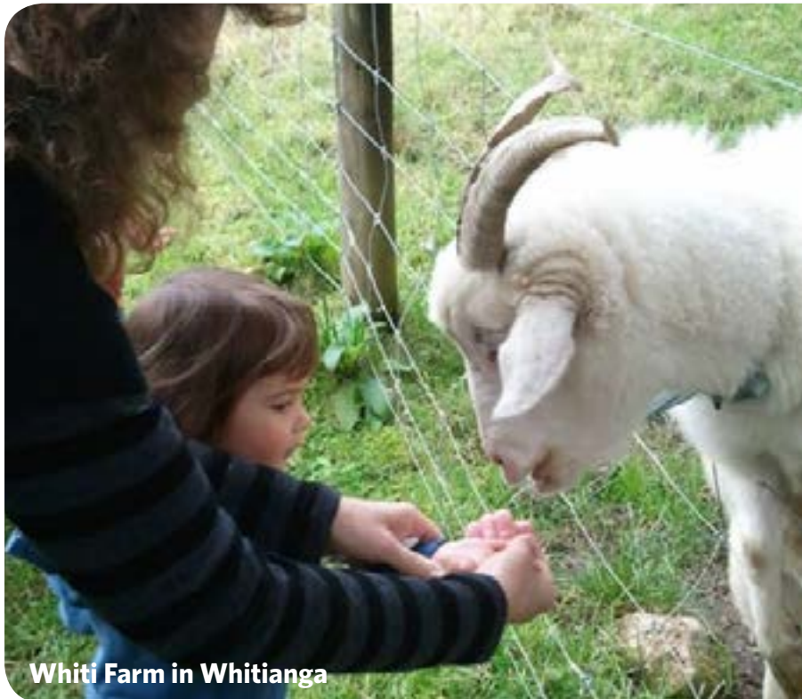
Whiti Farm in Whitianga

Marram's terms and conditions apply. Please see FAQ's at www.marram.co.nz