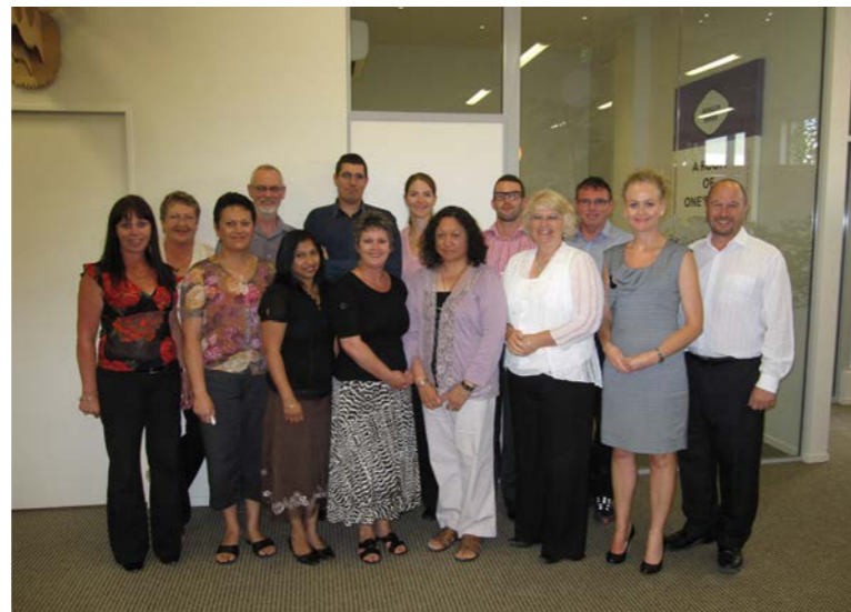
The Marram Team